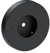
Surface mounting box (SANDY 2) SCE-SANDY-2