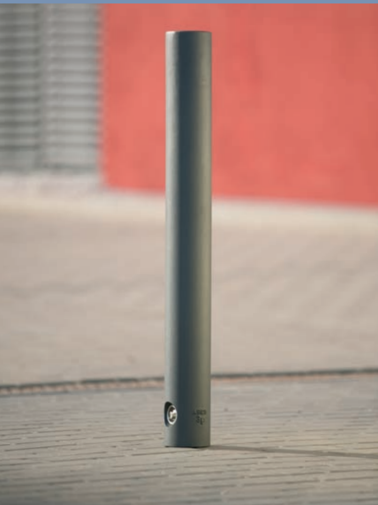
Colour: DB 703