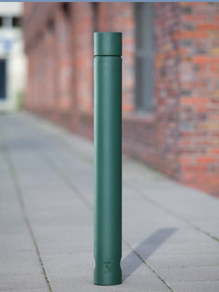
Colour: RAL 6009 Fir green