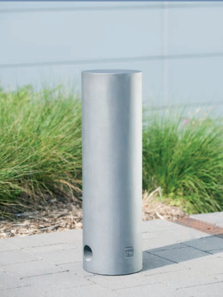
Colour: DB 703