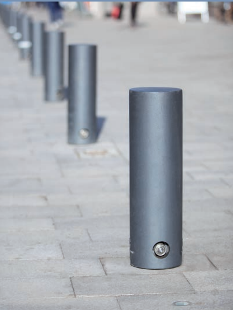
Colour: DB 703