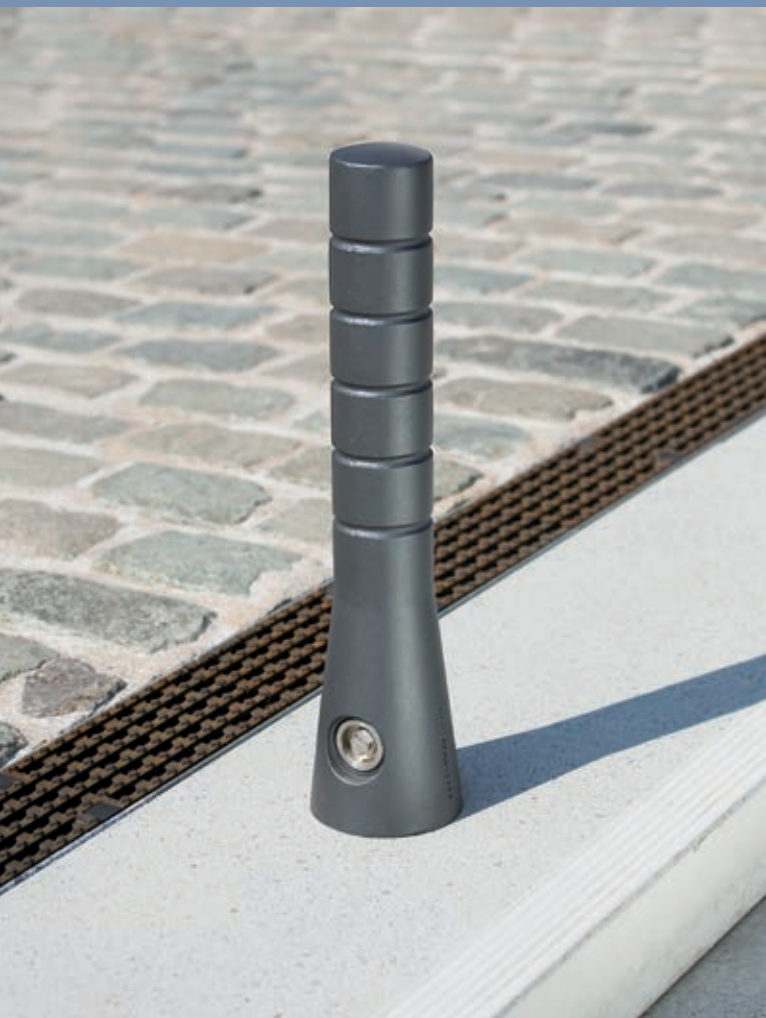
Colour: DB 703, Design: "hammer.runge design"