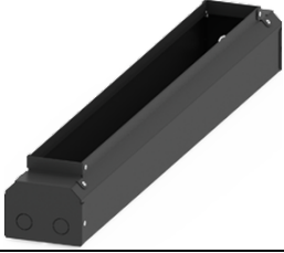
Recessing box A60951