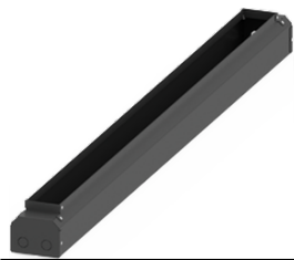
Recessing box A61051