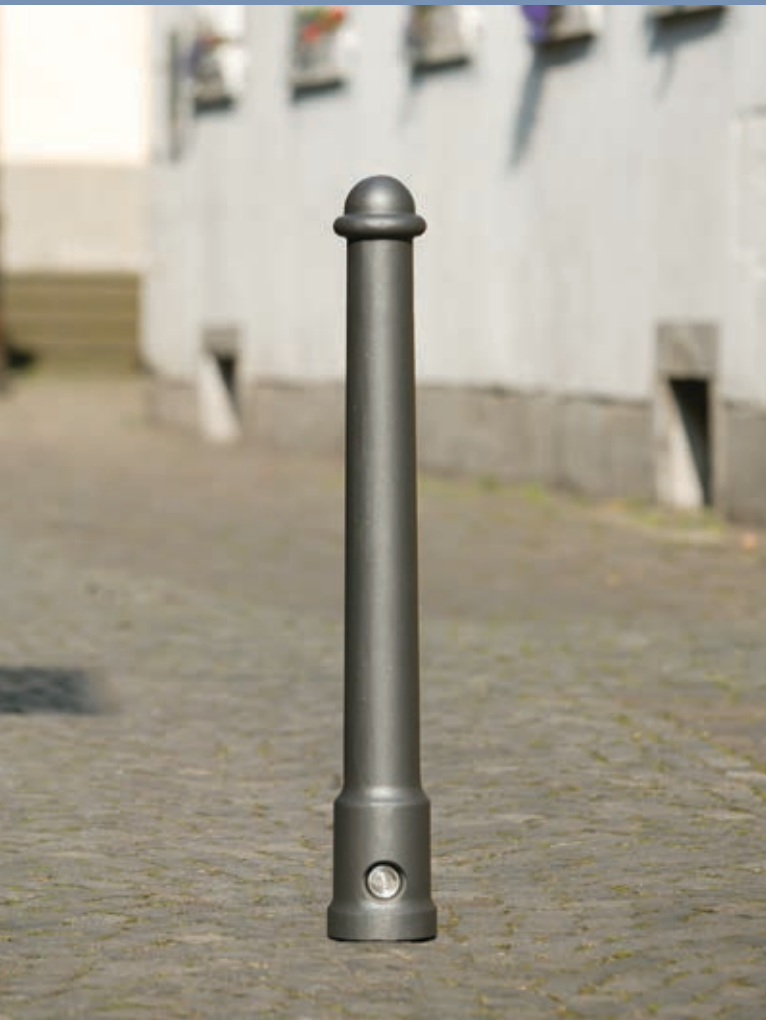
Colour: DB 703