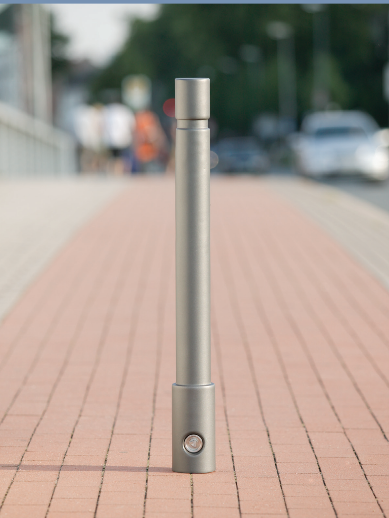
Colour: DB 703, Design: Thomas Wüsten – GFP