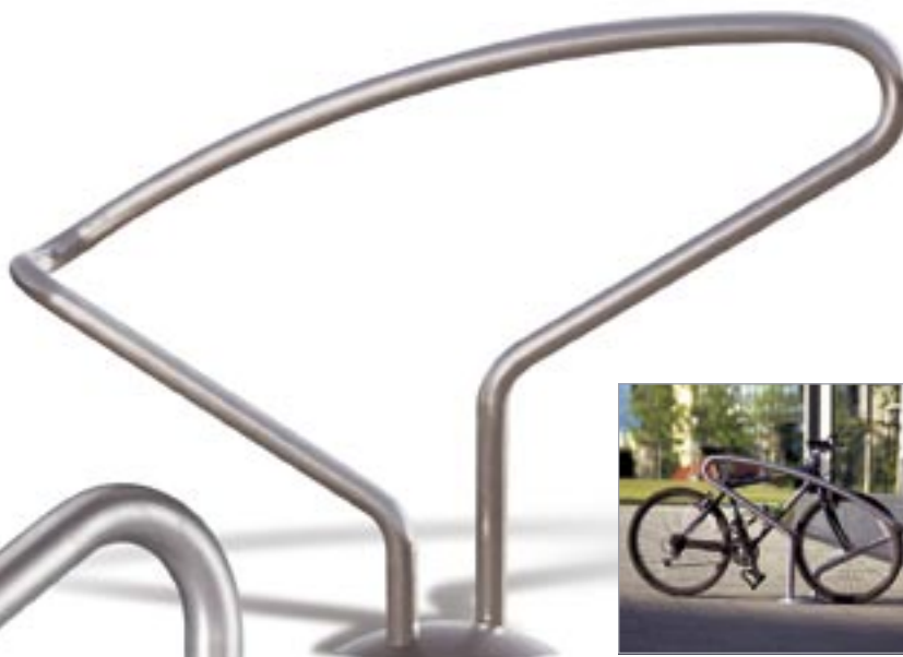
Signum II shown with optional base plate