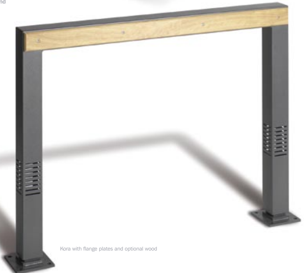
Kora with flange plates and optional wood