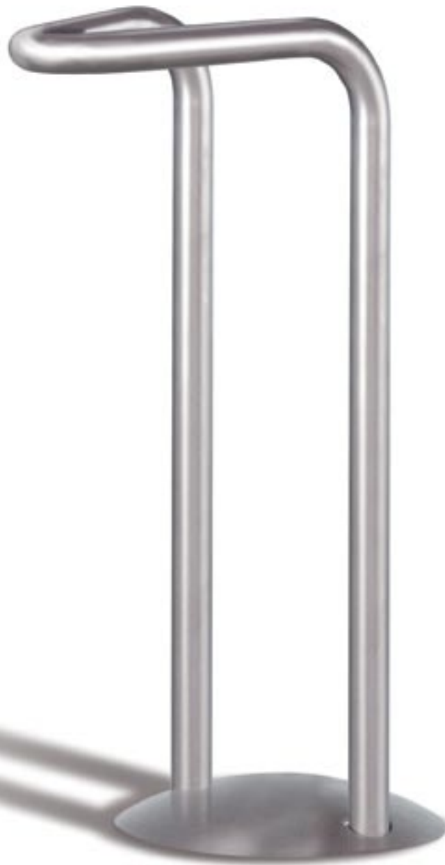
Shown with optional base plate