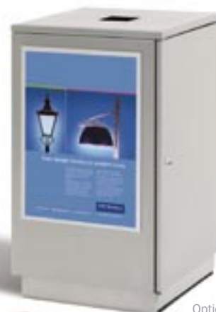
Optional advertising frames available