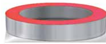
Circular LED 220